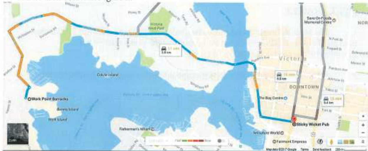
Figure 2: Relative location of Work Point Barracks to Sticky Wicket.

3. The Banquet will take place beginning at 1800 hrs on 27 Apr 2017 at the Sticky Wicket's Maple Room, 919 Douglas St. Location of venue relative the accommodations can be seen below in Figure 2.