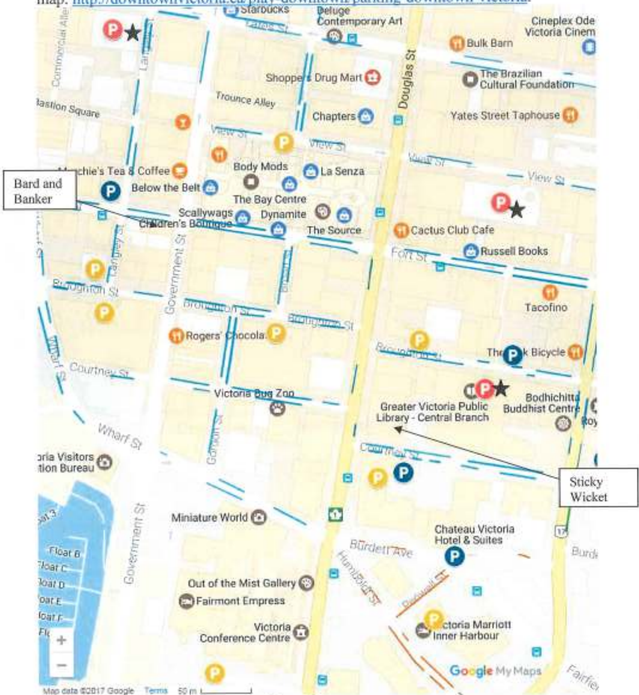
Figure 3: Parking Areas Downtown Near Venues.

4. Figure 3 below shows the parking lots and near the Bard and Banker and the Sticky Wicket. The lines along the road indicate street parking. The red P symbols next to stars indicate city owned parkades. Between 1800-0800 hrs parking in city owned parkades is free. For further information about parking please refer to the source of the map: http://downtownvictoria.ca/play-downtown/parking-downtown-victoria .