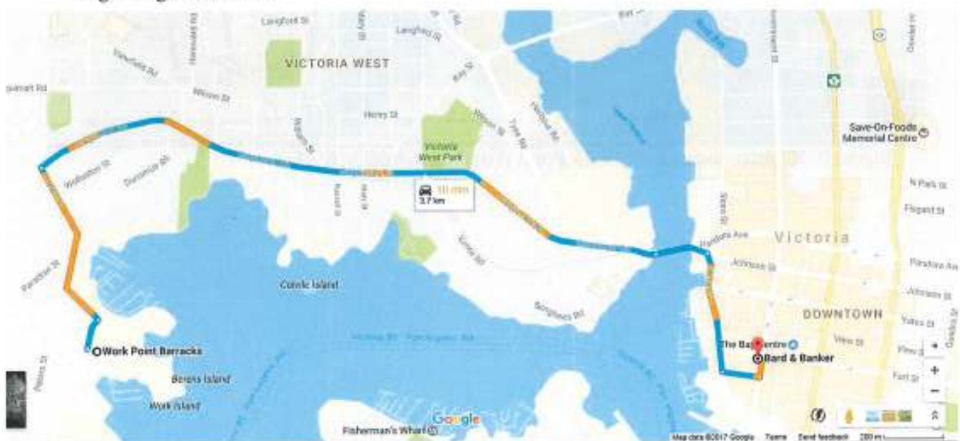
Figure 1: Relative location of Work Point Barracks to Bard and Banker.