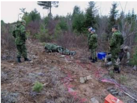
MGen Whitecross watches as an IED operator carefully inspects a device

BEOC students completed a number of Engineer tasks including mobility with the construction of MGB, MR, route opening and a minefield breach. Counter mobility tasks included minefield laying, route denial and a bridge demolition. Survivability tasks incorporated FOB construction, an elevated/Ground Op and the building of fortifications.