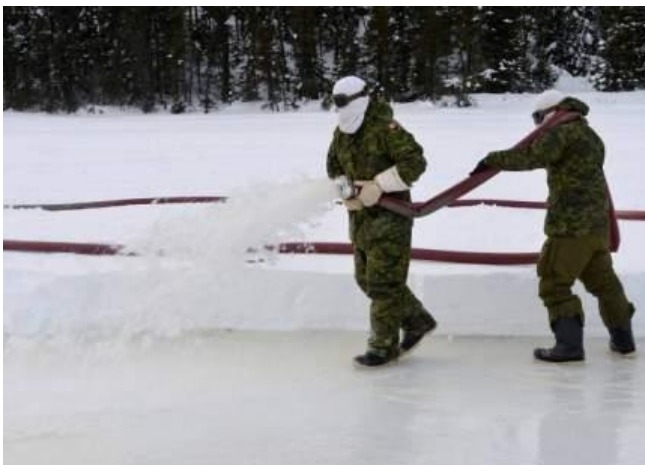
Flooding the Ice Road

Very much a low level basic Ex the first part was spent qualifying soldiers in Basic Winter Warfare (BWW) and Land Over Snow Vehicle (LOSV) qualifications. Upon completion of the initial Trg the Sqns were rotated with one Sqn going on a five day long range patrol and the other Sqn conducting stands Trg which included small arms, demolitions, construction of snow and ice defences, ice bridging and advanced survival skills taught by the 25 Canadian Rangers who supported the Ex.