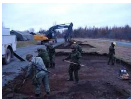
Excavation for concrete pads