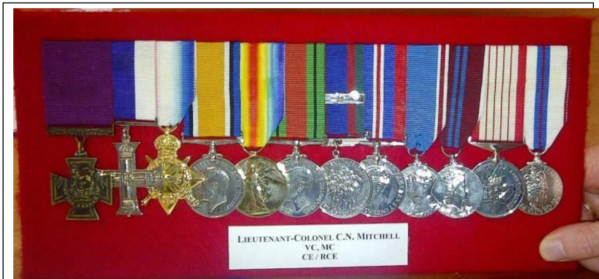
Visit the CME Museum and get an up close and personal look at LCol Mitchell's Medals