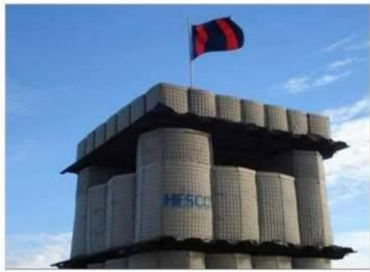
Completed Force Protection Task

They also constructed a steel girder NSB at Lindsay Valley and 2 helicopter landing sites. An austere camp at CAMP PLAISANCE was built to accommodate 80 pers complete with concrete pads and a classroom with steel frame foundation (10' x 18').