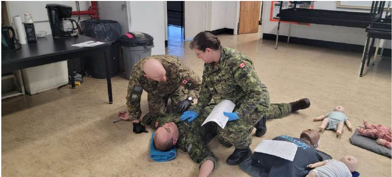
Ex Relentless Warrior in Edmonton - 31 January – 1 February 2026